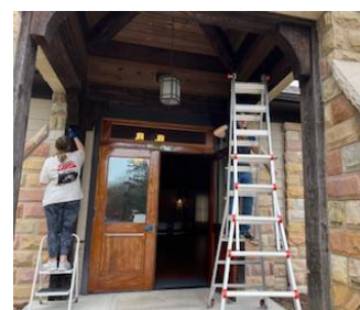
Then there was the amazing work day when 18 volunteers turned