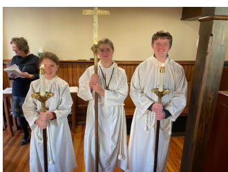
You've probably noticed the increased presence of our wonderful acolytes as more of our