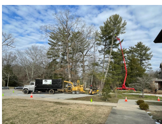
Lent at St. Mark and St. Paul was not just contemplation, worship and education, there