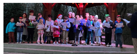
The Children's Choir sang at the community tree lighting in Angel Park