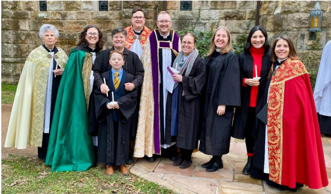
Lessons & Carols 2025