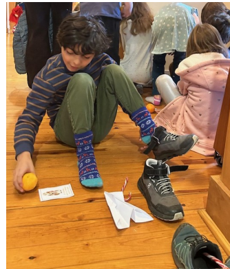
St. Nicholas visit.