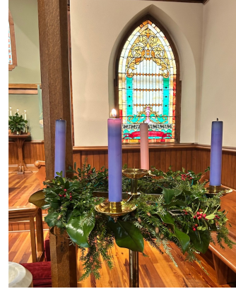
Advent Wreath making