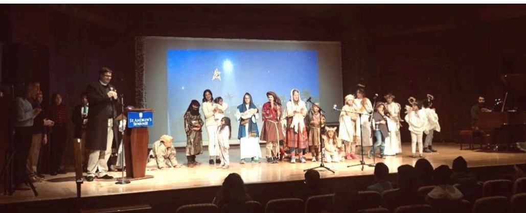
Spreading Christmas Cheer